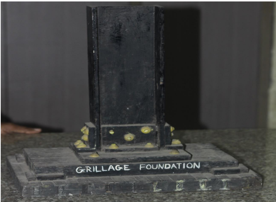
Wooden Model of Grillage Foundation (Made in Steel)