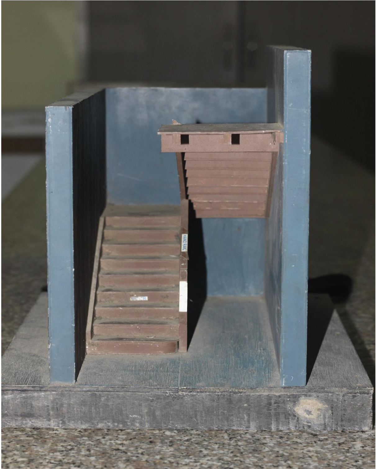
Wooden Model of Dog-Legged Staircase