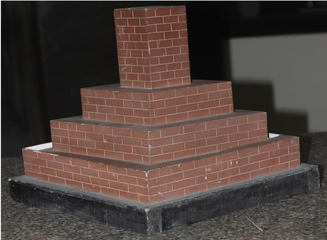
Wooden Model of Simple Steeped Footing (Made in Bricks)